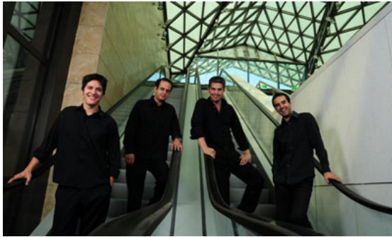
Author: Jenny Flower -Athens desk

When it comes to accessible and good classical music, Parnassos is the place